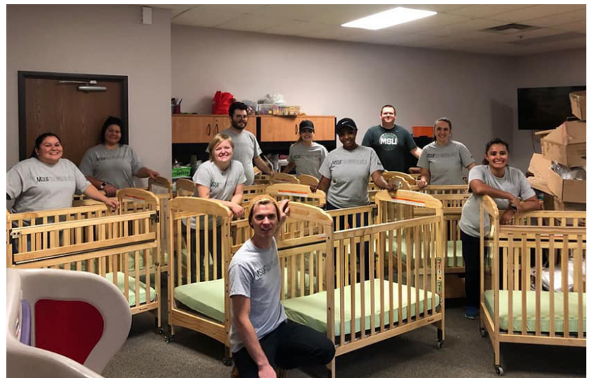
Desk Drawer Fund volunteers help build cribs for Child and Family Charities.

The $500,000 contribution supports the Be the Light campaign, which brightens the path for all who come to CFC for assistance at times of crisis and need. In addition, the contribution will enable the organization to move services to a centrally located campus in Lansing and increase the number of children and families served by 1,500 individuals.